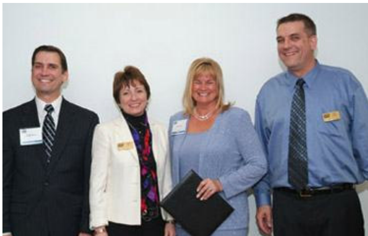
Graduate program participants after accepting certificates of completion.